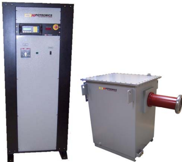
Standard System Controller

Hipotronics AC Dielectric Test Sets are available in a wide range of voltage and power ratings with exceptional reliability, durability and functionality. No matter what your requirement, Hipotronics has an affordably priced, highly reliable test solution to meet your needs.