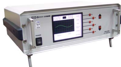
DDX Series Partial Discharge Detectors